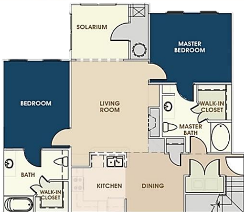
Aspen 2BD/2BA 1267 SQFT* $1,155 - $1,180/Month