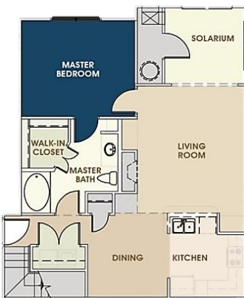
Linden 1BD/1BA 918 SQFT* $1,095/Month