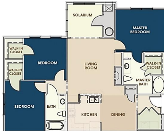
Hawthorne 3BD/2BA 1450 SQFT* $1,305 - $1,355/Month